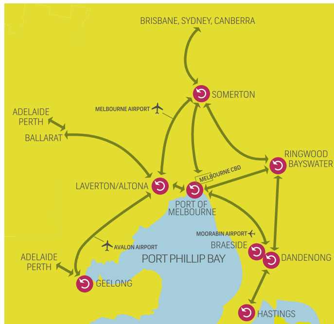
MAJOR FREIGHT MOVEMENTS AROUND MELBOURNE

The ports of Melbourne, Geelong and Hastings, and Melbourne and Avalon airports are crucial economic gateways, facilitating the import and export of goods between overseas, local, regional and interstate markets.